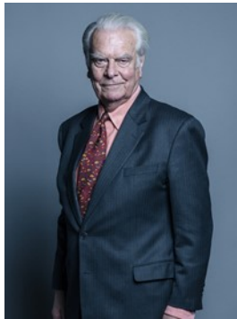
The Rt Hon Lord Owen CH FRCP

The Chase School, Geraldine Road, Malvern, Worcestershire, WR14 3NZ